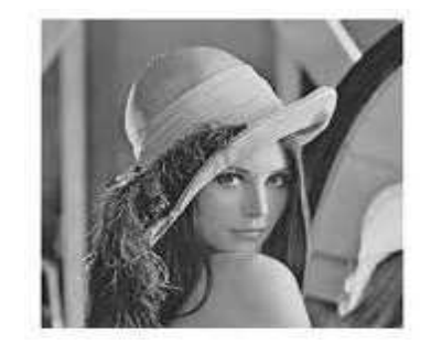
Figure 4: Secret Image