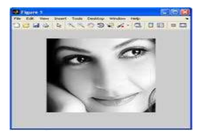
Figure 2: Cover Image

Figure 5, shows the intensity values of the cover image that are obtained while converting an image into matrix.