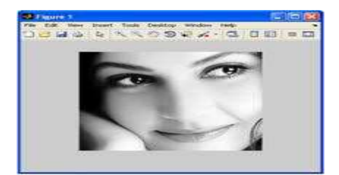
Figure 6: Stegano Image